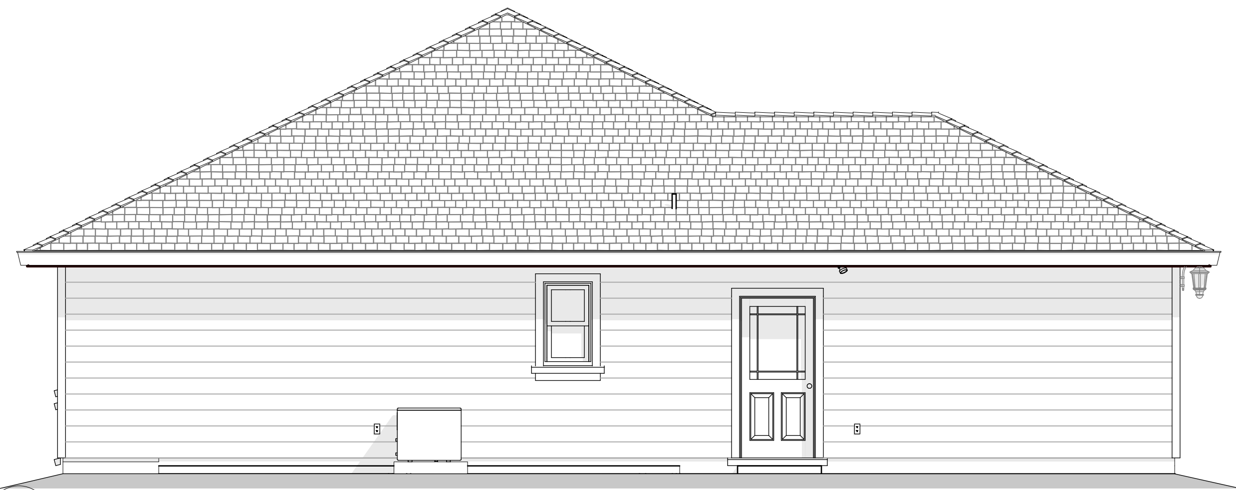
4 LEFT ELEVATION SCALE: 1/4" = 1'-0"