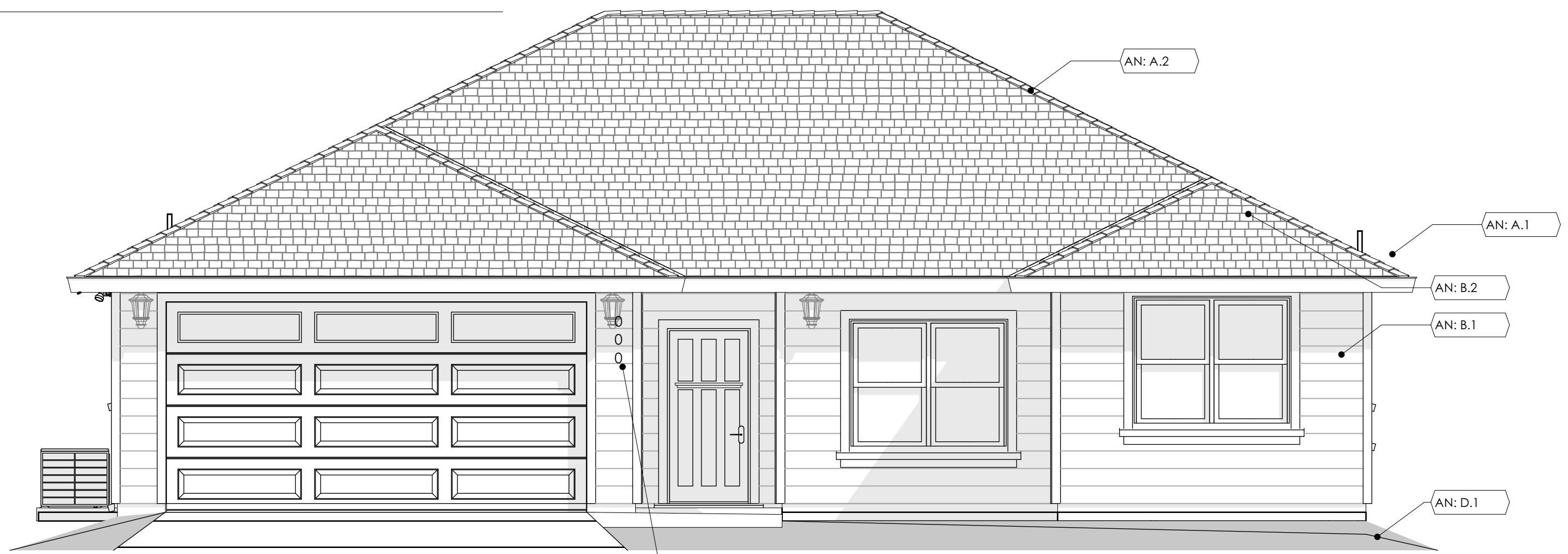
1 FRONT ELEVATION SCALE: 1/4" = 1'-0"