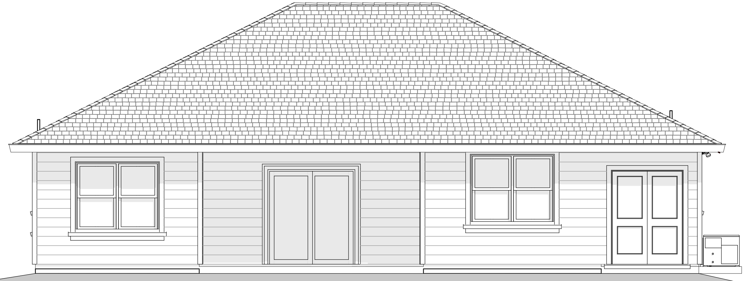
3 BACK ELEVATION SCALE: 1/4" = 1'-0"